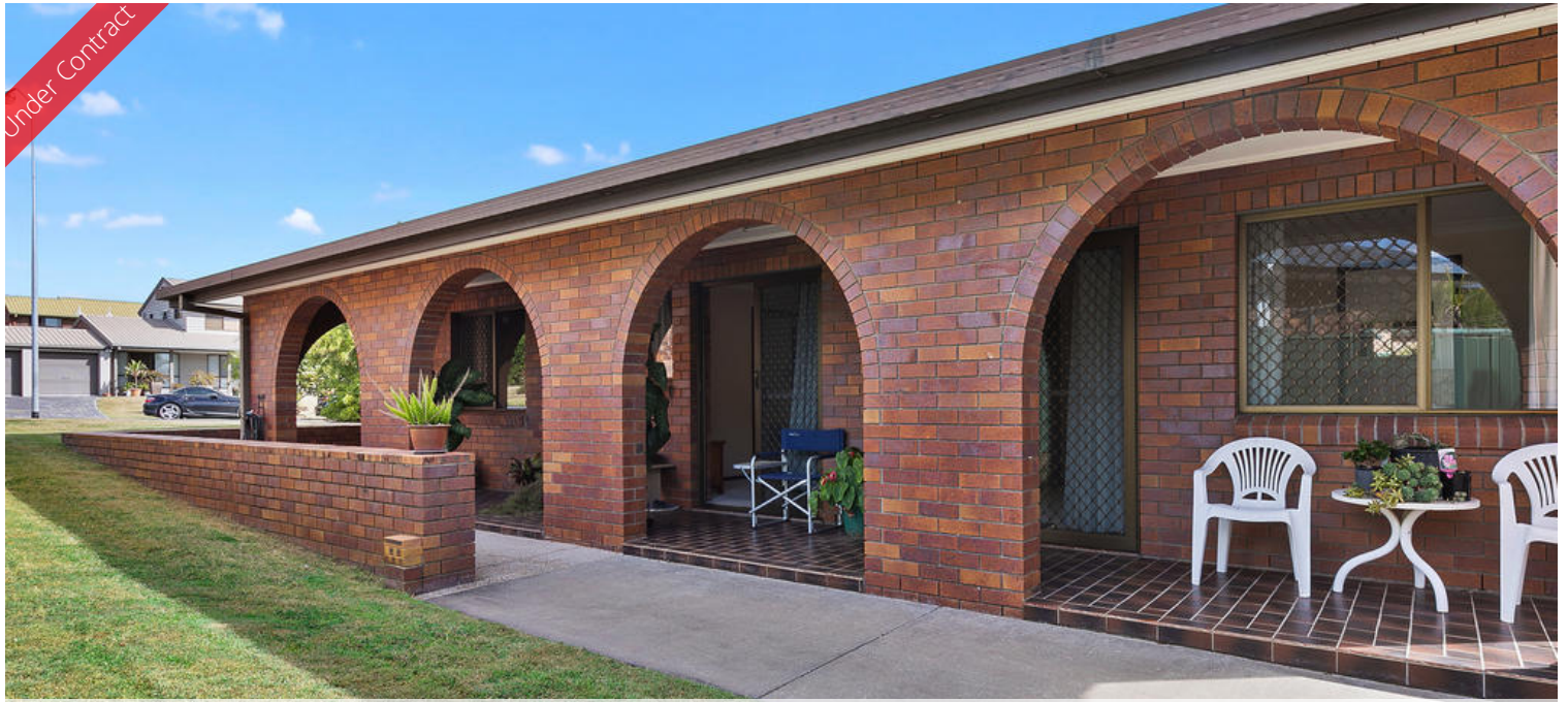
6 Keston Ct, Tingalpa