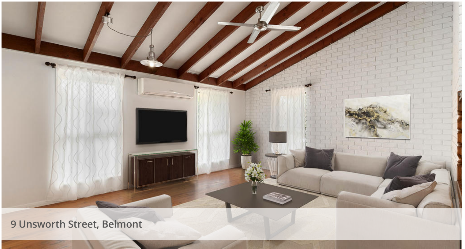
9 Unsworth Street, Belmont