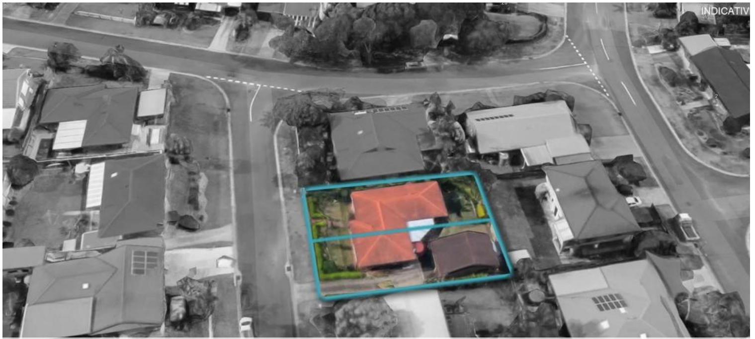
29 Wambaya St, Belmont